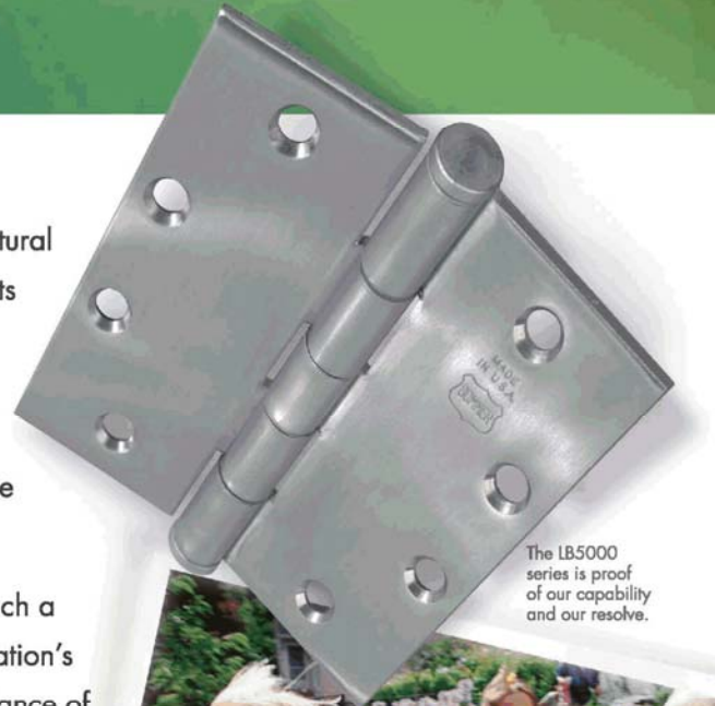
The LB5000 series is proof of our capability and our resolve.