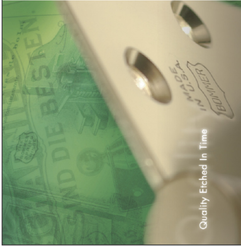
Quality Etched In Time