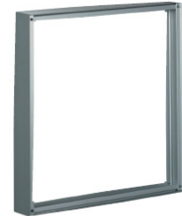
MODEL 9343 Aluminum semi-recess mounting frame (4" wall depth required)