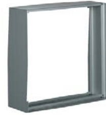
MODEL 9341 Aluminum full surface mounting frame